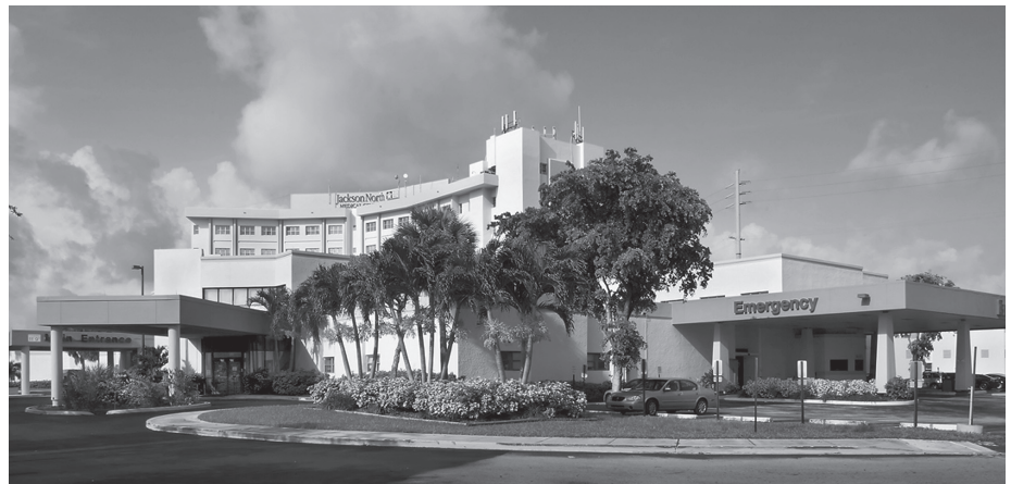
Jackson North Medical Center

Commercial & Industrial Branch. "From the boiler room to the board room, organizations are leading the way by making their buildings more efficient and earning EPA's ENERGY STAR certification."