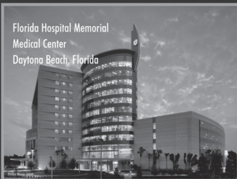
Florida Hospital Memorial Medical Center Daytona Beach, Florida

Birmingham Charlotte Dallas Huntsville Nashville Orlando