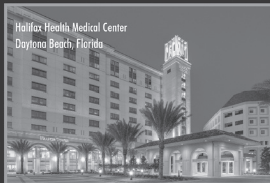
Halifax Health Medical Center Daytona Beach, Florida