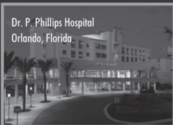
Dr. P. Phillips Hospital Orlando, Florida