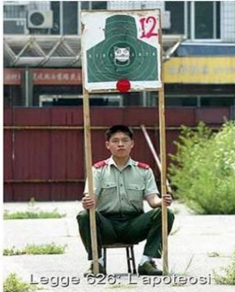
Legge 626: L'apoteosi