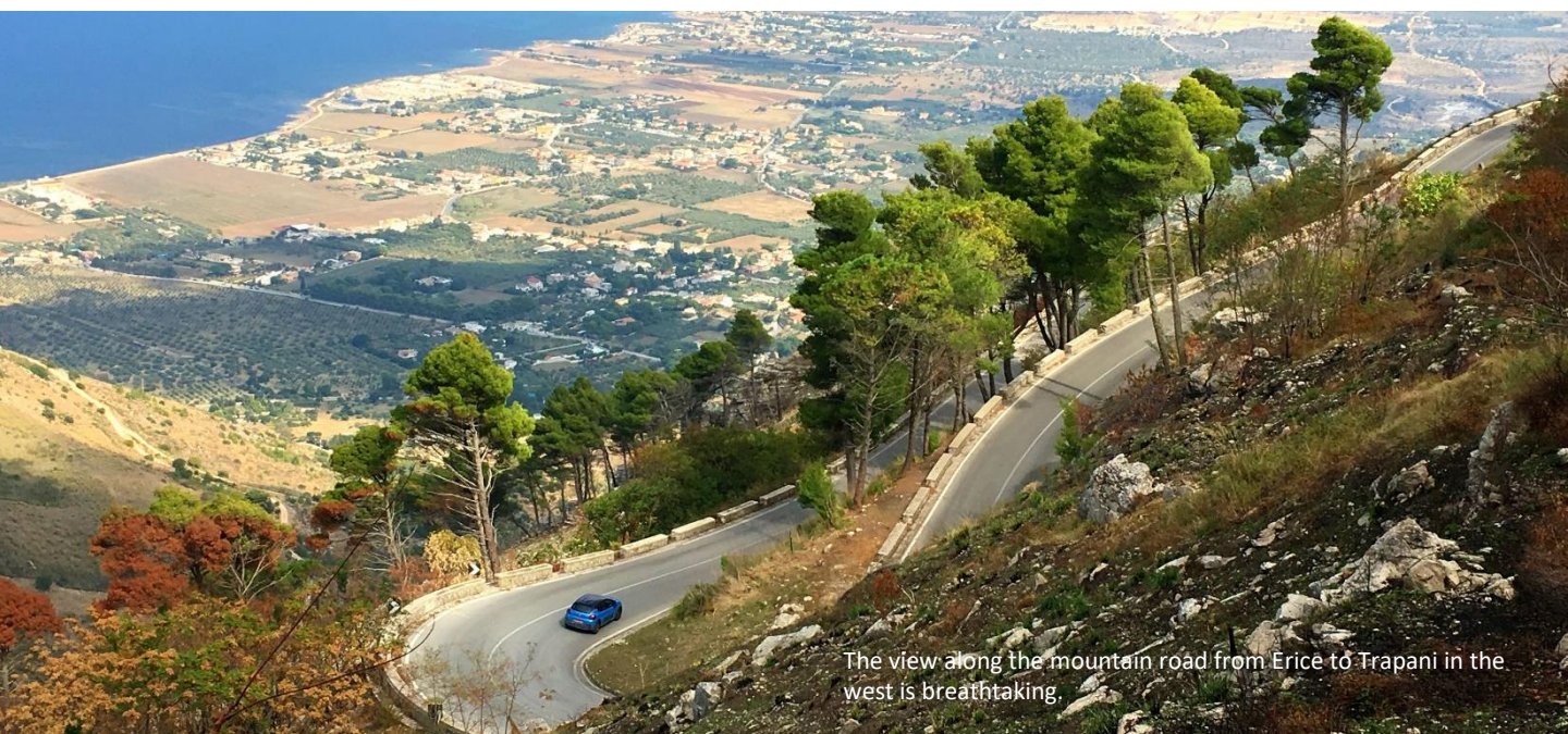
The view along the mountain road from Erice to Trapani in the west is breathtaking.

Sicily is full of cultural treasures and architectural gems. You will find out by learning the history of Agrigento's Valley of the Temples on the southern coast, the largest and best-preserved collection of ancient Greek buildings outside Greece, from a professional guide; appreciating the true beauty of Ragusa by spending two nights in the middle of this magnificent Baroque town set amid the rocky peaks; tasting some of the best wines and seafood in the wine region of Vittoria, or the divine chocolate made in Modica only by following the oldest recipe.