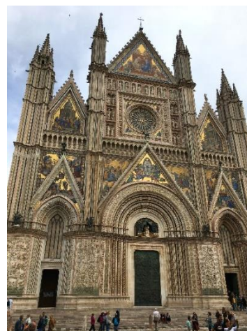
The façade of the Duomo in Ovrieto contains stunning golden mosaics.