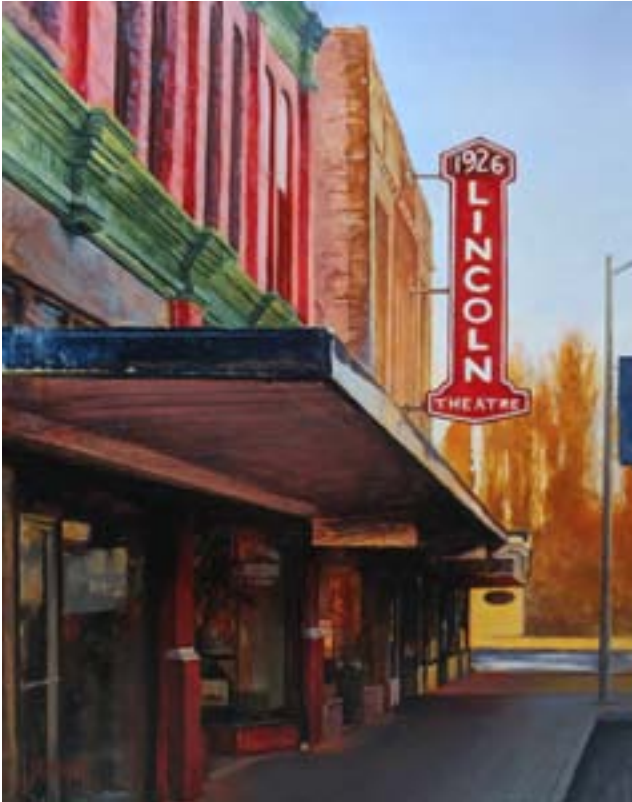
Glowing Revue, 2017 Oil on board | 16" x 20"

The two most important messages I want to convey through my art is Love & Storytelling. My purpose as an artist is to capture the essence of the world around me. I paint moments in time, and share memories of places through painting. I paint the beautiful Skagit Valley and Northwest. The places and people are rich in visual vocabulary with farmland, towns, sea, sky, flora and fauna.