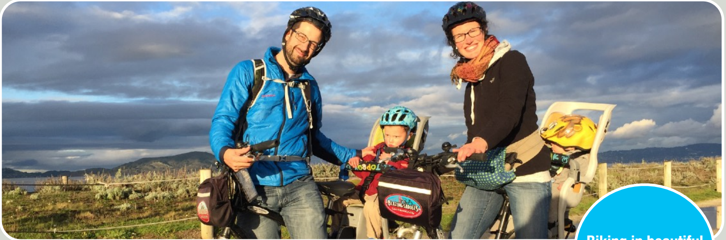
Biking in beautiful San Francisco