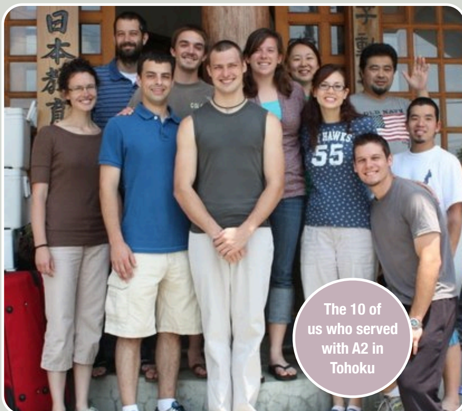
The 10 of us who served with A2 in Tohoku