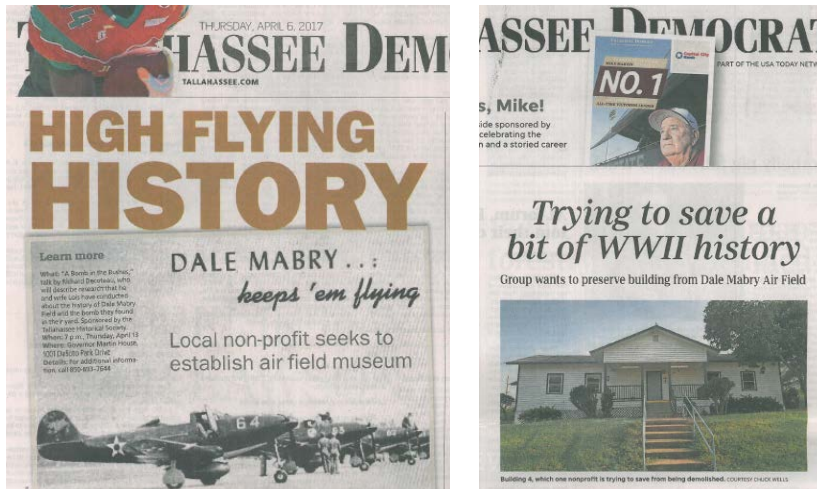
Front pages of the Tallahassee Democrat