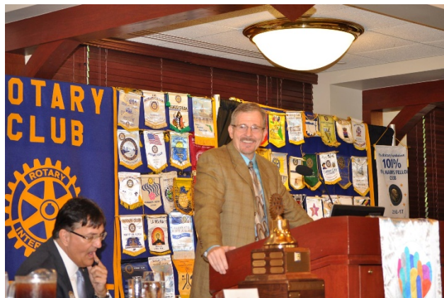
Presentation at the Downtown Rotary Club

We have given presentations to the Tallahassee, Experimental Aircraft Association, Chapter 445, the Tallahassee Air Force Association, and the Monticello, Tallahassee Downtown and Chattahoochee Rotary Clubs. We also had a table at the 2018 Honor Flight welcome home.