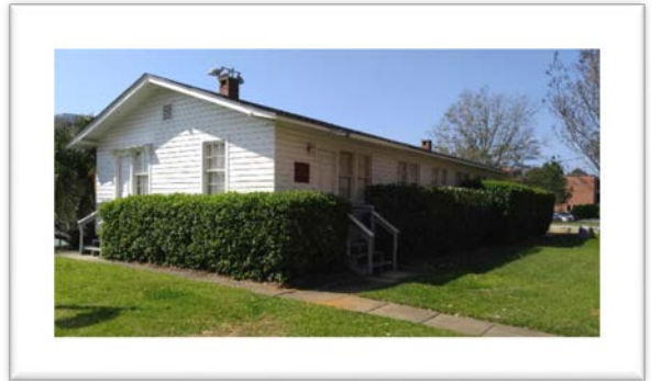
Building 4 owned by Leon County Schools (L) and Building 264 at FSU (R)