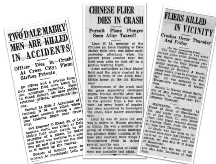
Headlines from the Daily Democrat circa 1941-45

In addition to our webpage ( www.dmaaf.org ), we created a Facebook site ( www.facebook.com/DMAAFTally ) and a GoFundMe site ( www.GoFundMe.com/DMAAF ). We currently have 105 followers. We try to post at least once per week and include news of our efforts and news from the past. Six hundred and eighty-two people viewed our Memorial Day 2018 post where we detailed our goal for a memorial garden honoring the estimated 285 men and women who lost their lives while serving and training at Dale Mabry Field.