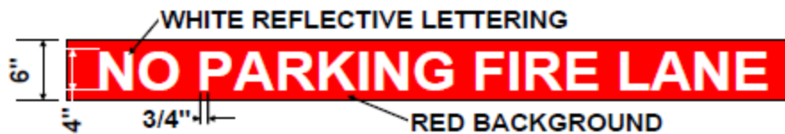
Figure D103.7. Fire Lane Striping. Add a new Figure D103.7. Fire Lane Striping. As follows:

Amend the subtitle of Appendix E to read as follows: