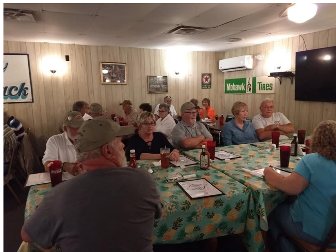
Drive and Dine to the Grease Rack <<<