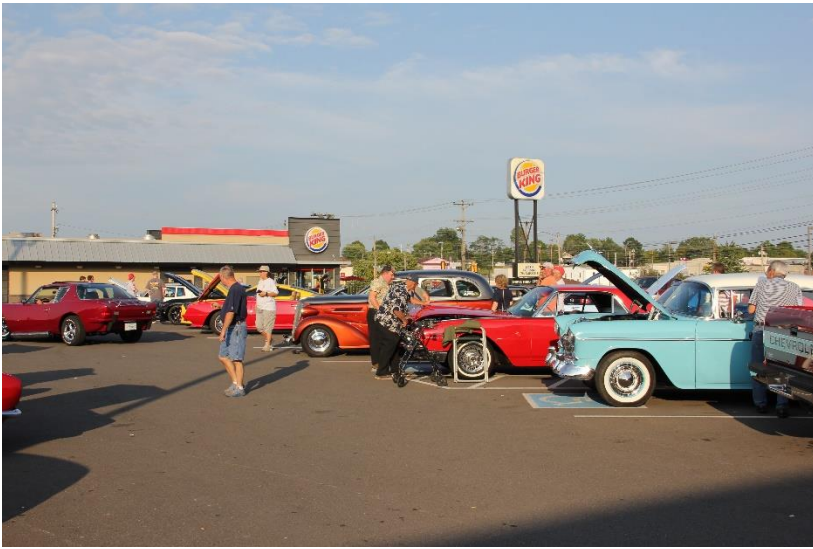
<<<<<<A Bunch of folks

Hamblen county car club members featured this month: