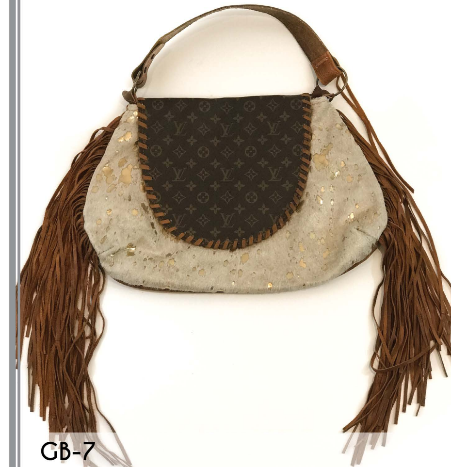
GB-7 LV Stitch Satchel $230