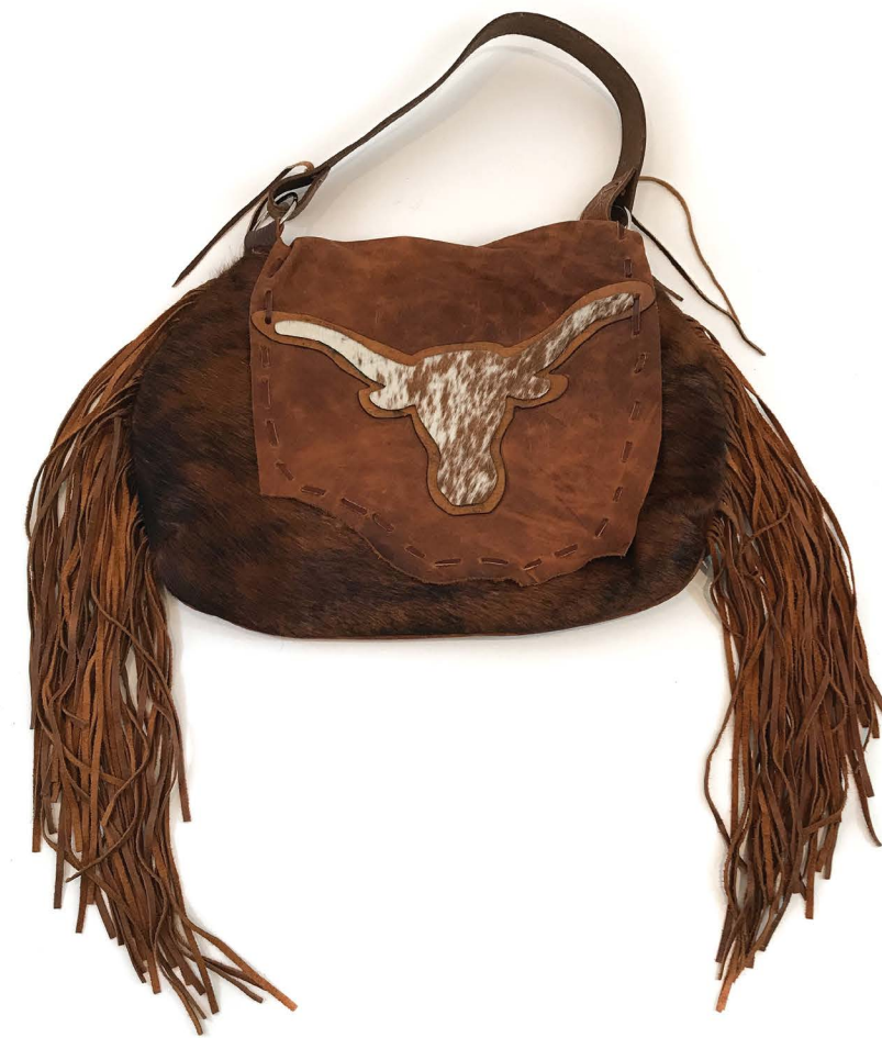
GB-6 Bullhead Satchel $230