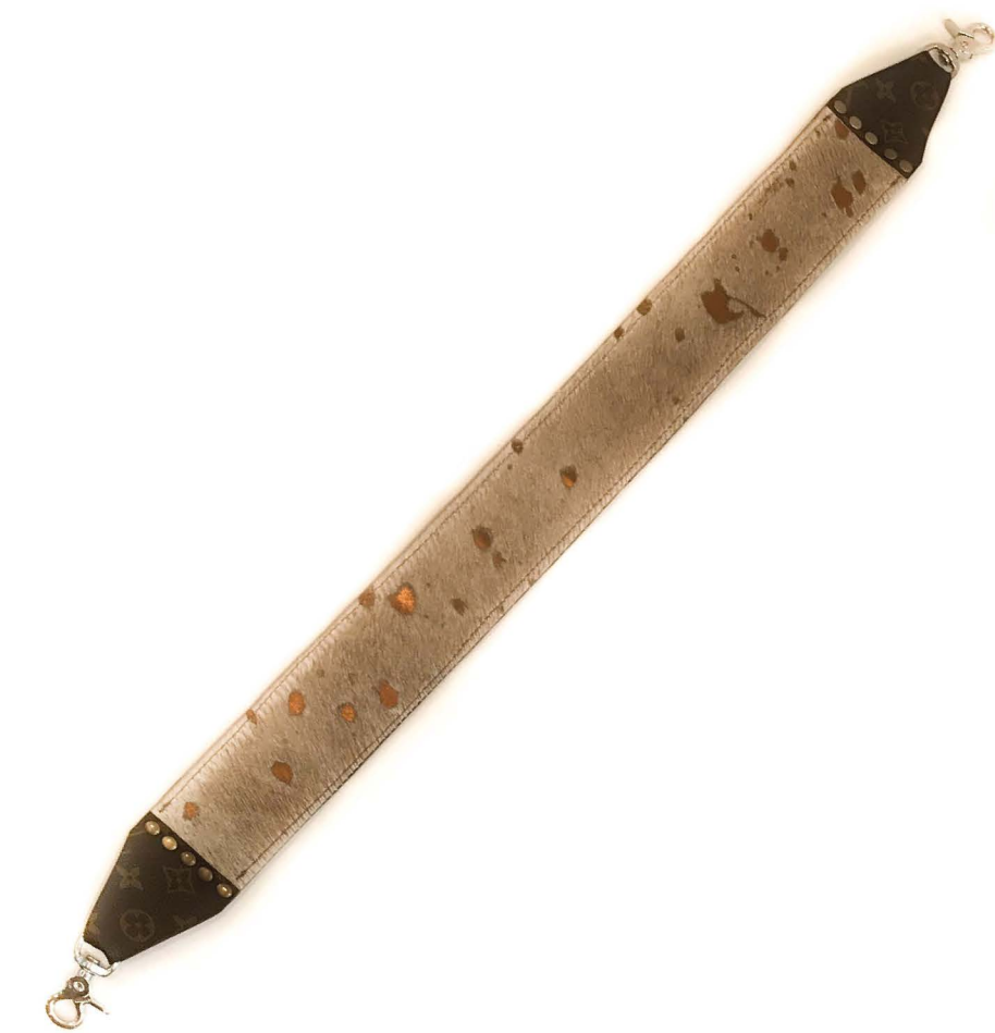
LS-01 Strap (Choose One Swatch) $115

Notes: -An LV Strip can be added to bags for an additional $20 -Straps can be added to bags for an additional $15 -Fringe can be removed from bags