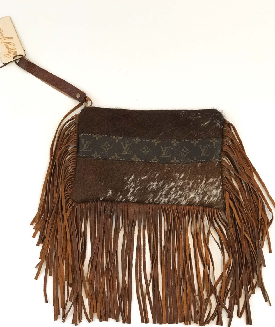
LLC-3 LV Striped Clutch $161