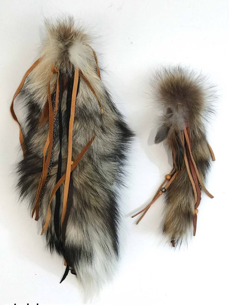
Add-ons: FT- 1: Fox Tail (large) $38 without bag, $30 with bag RT- 1: Raccoon Tail (small) $28 without bag, $20 with bag