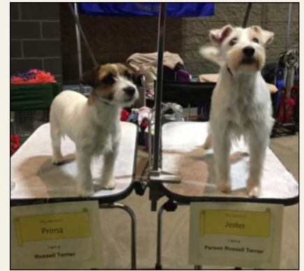
Prima and Jester in the spotlight

whole was well represented with a majority of the breeds in attendance.