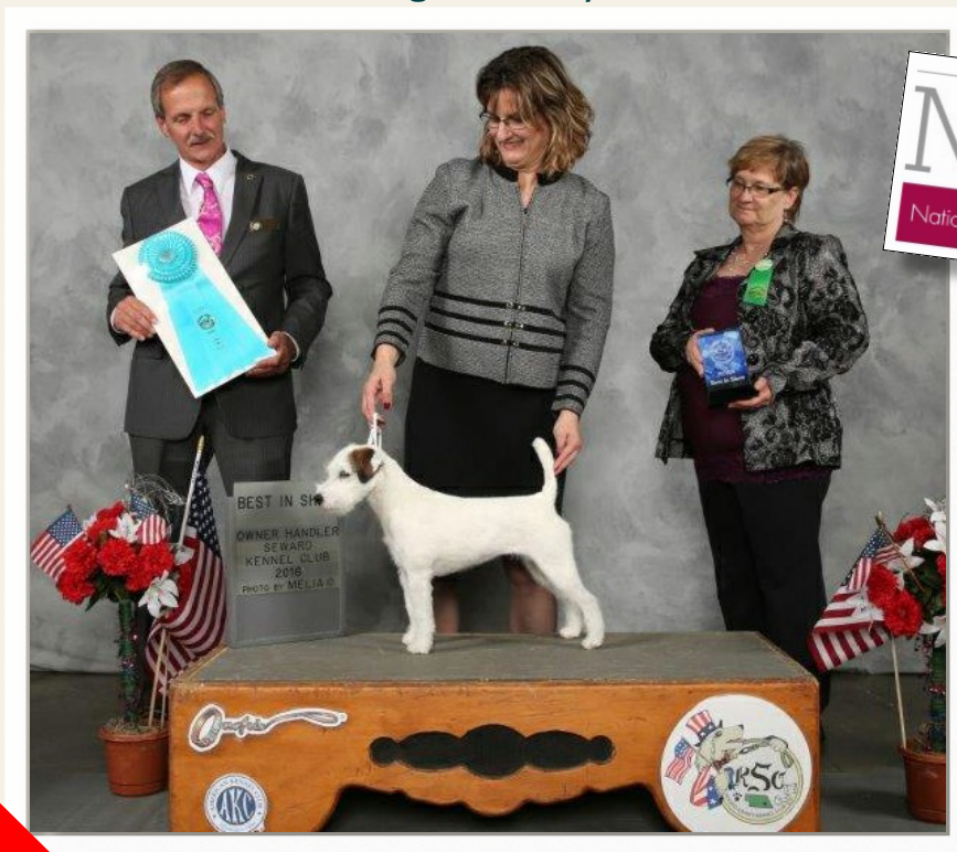
No.1 CH Posey Canyon Classic Hijinx