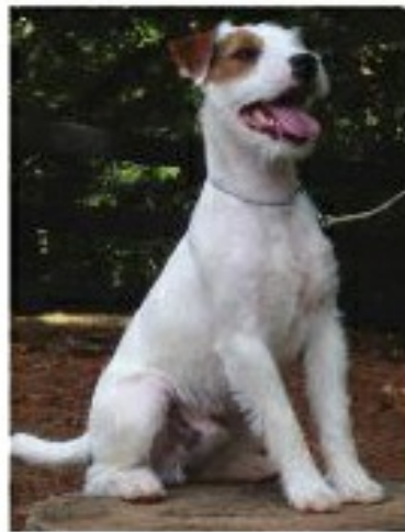
Preston works on focusing on his owner as he sits on a tree