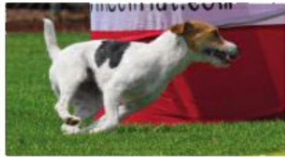
Showing the breed's speed and nimbleness, Endo races around an agility

varieties, all of which bear the parson's name in some form and spring from common ancestry. The name "Parson Russell Terrier" stems from a dispute within the breed between those who wanted to be recognized by the major kennel clubs and those who wanted the breed standard to focus on hunting ability rather than conformation. Parson Russell Terrier is the name given those dogs that have distinctly bred bloodlines, a clear breed standard and description and are registered with the American Kennel Club. (Note: The AKC also recognizes the "Australian branch" of the breed, the Russell Terrier.)