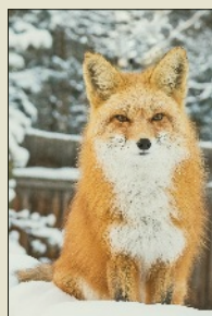
Cover photo © Mindy Musick King Photography