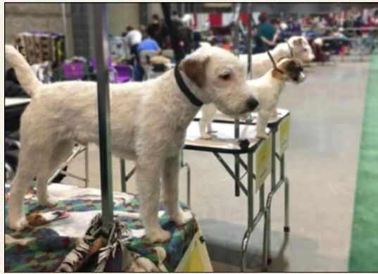
Ready to welcome visitors