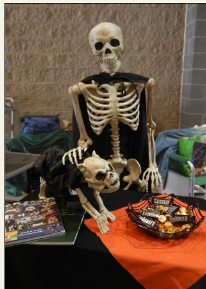
The PRTAA is a popular stop