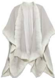
STERLING / WHITE