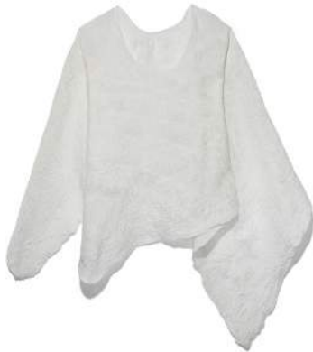
WHITE / WHITE ROMANTIC PONCHO

Romantic Poncho $79 All-Over-Wool Poncho $114