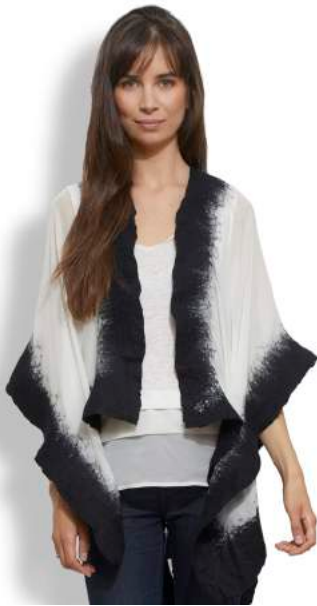
WHITE / BLACK

Luxurious sheer silk framed by ultra-fine merino wool edging. Measures approximately 50" long by 40" wide.