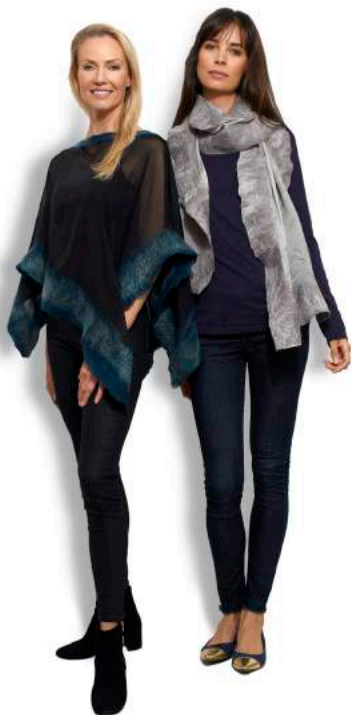
Poncho in BLACK / PETROL SHIMMER & Scarf in STERLING/GREY SHIMMER

SCARF: Silk chiffon framed by ultra-fine merino wool, blended with shimmery tencel fibers. Measures approximately 15"W x 83"L - can be worn as a shoulder wrap or scarf. PONCHO: Sheer silk chiffon with ultra-fine merino wool trimmed edge and neckline. Hangs approximately 30" from neck to tip. WRAP: measures approximately 30"W x 83"L.