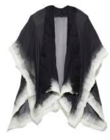
BLACK / BLACK & WHITE