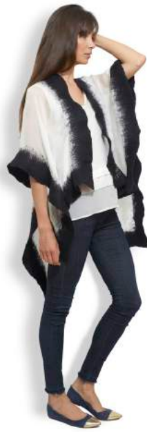
WHITE / BLACK