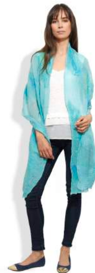
AEGEAN / ROBIN'S EGG