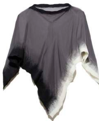
SLATE / BLACK & WHITE