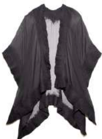
BLACK / BLACK