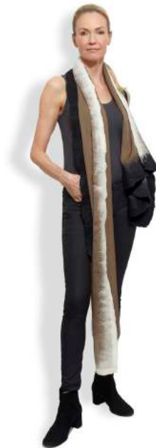
TAUPE / BLACK / WHITE