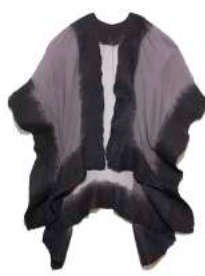
SLATE / BLACK