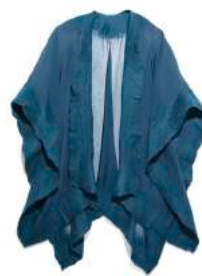
PETROL / PETROL