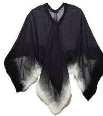
BLACK / BLACK & WHITE