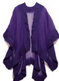
INDIGO / NAVY