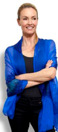
ROME / COBALT