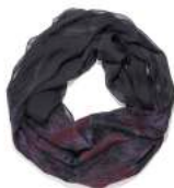
PARIS SPRING / BLACK-SUBTLE ACCENTS

Silk chiffon with ultra-fine merino wool embellishment. INFINITY Scarf measures approximately 10"W x 32" Diameter - can be worn single, doubled or tripled. SMALL Scarf measures approximately 10"W x 76"L. MEDIUM Wrap measures approximately 22"W x 75"L - can be worn as wrap or scarf. LARGE Wrap measures approximately 25"W x 86"L - can be worn as wrap or oversized scarf.