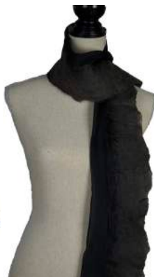
BLACK / GUNMETAL