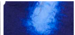
COBALT / NAVY