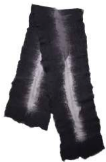
SLATE / BLACK