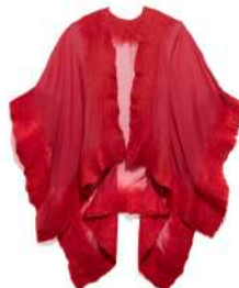
POMEGRANATE / CHERRY