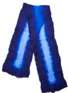
COBALT / NAVY