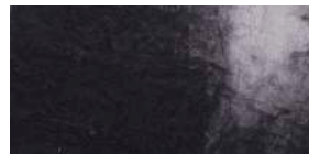
SLATE / BLACK