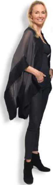
SLATE / BLACK