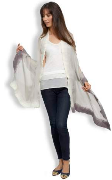
GREY / WHITE