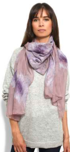
VENICE / DUSTY ROSE