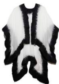
WHITE / BLACK