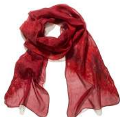
GRENADA / POMEGRANATE