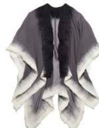
SLATE / BLACK & WHITE