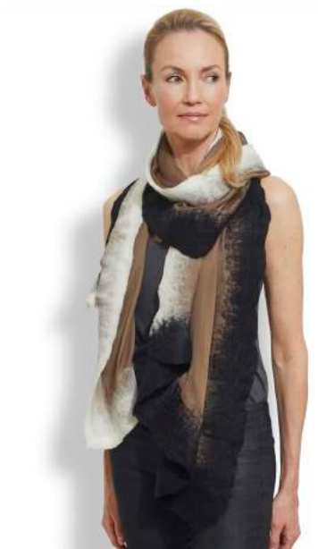
TAUPE / BLACK / WHITE

Silk chiffon framed by ultra-fine merino wool. Scarf measures approximately 15"W x 83"L - can be worn as a shoulder wrap or scarf. Frame Wrap measures approximately 30"W x 83"L.