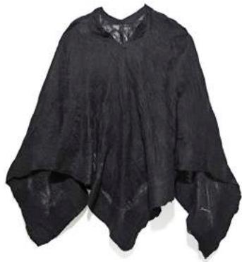
BLACK / BLACK ALL-OVER-WOOL (AOW) PONCHO