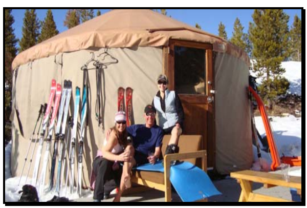
A relaxing day at the Ridge Yurt!

For more information about the Bear River Outdoor Recreation Alliance, the Wasatch-Cache National Forest, the Lily Lake trail system, and yurts, please visit www.brorayurts.org.