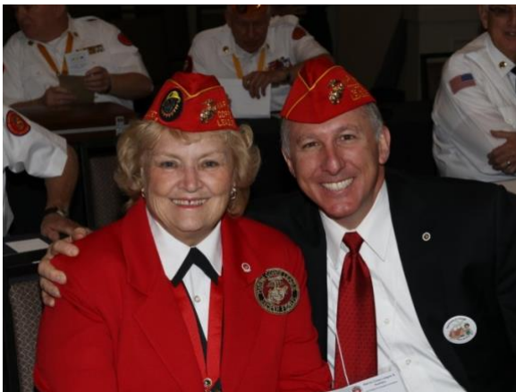
Smiles all around!