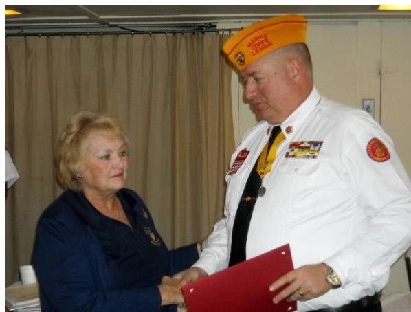
Time for awards