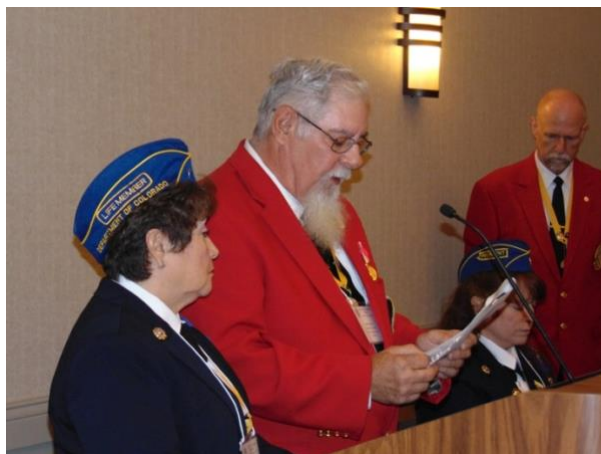
Time for prayer