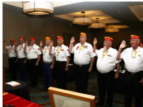
Department officers sworn in.