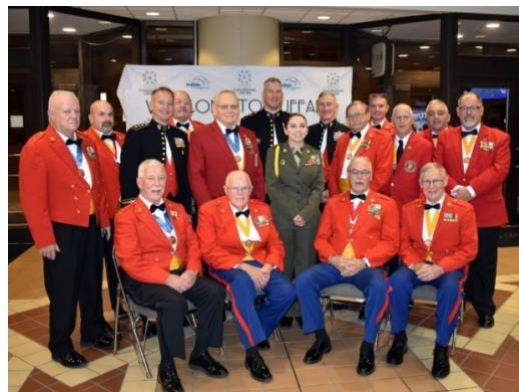
2018-2019 MCL Executive Board and Officers