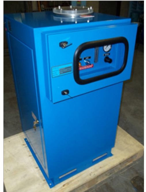
PSA1 shown with optional weather-proof cabinet

OzoPulse™ TYPE PSA ozone generating systems are designed specifically for small installations. These modular designs incorporate all the necessary components on frame mounted packages providing cost effective, easily serviced units. Type PSA units range in capacities from 1.1 to 22 lbs/day in air. OzoPulse™ Type PSA systems can be supplied with complete air prep package, ozone generator, off gas destructor and system interfacing controls.