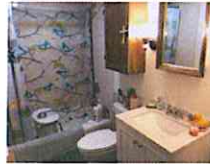
80 year old female with cancer, stroke