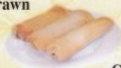
(42) 蒜蓉蝦春卷 Deep Fried Prawn Spring Rolls