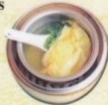
(20) 魚翅灌湯餃 Soup Dumplings with Fish Fin