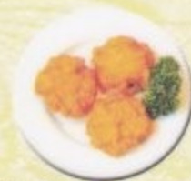
(49) 香茜墨魚餅 Deep Fried Squid Cake