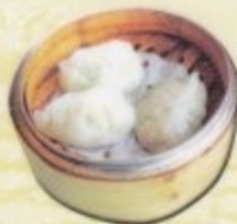
(5) 潮州粉果 Chiu Chow Dumplings with Pork & Peanut