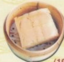
(19) 吉士馬拉糕 Custard Sponge Cake