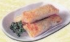
(52) 百花腐皮卷 Deep Fried Bean Curd Rolls Stuffed Minced Prawn