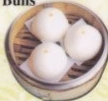
(18) 香滑奶皇包 Cream Custard Buns