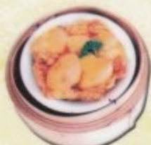
(13) 沙茶墨魚仔 Baby Octopus in Sha Char Sauce