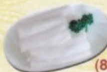
(87) 香滑淨腸粉 Plain Cheung Fun