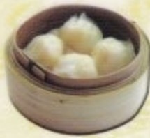
(1) 金牌鮮蝦餃 'Har Kau' Prawn Dumplings