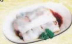
(80) 三寶滑腸粉 3 Mixed Style Cheung Fun