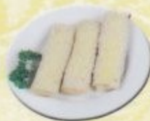
(51) 芝麻炸蝦筒 Deep Fried Prawn Rolls