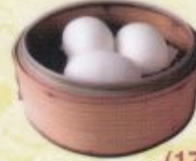
(17) 蛋黃蓮蓉包 Lotus Paste Buns