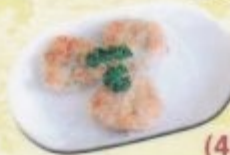
(43) 香煎韭菜餅 Grilled Meat & Chives Dumplings