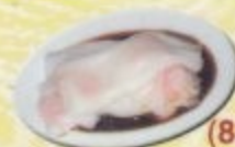
(81) 鮮蝦滑腸粉 King Prawn Cheung Fun