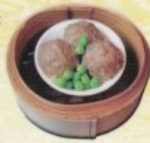
(14) 鮮竹牛肉球 Beef Dumplings