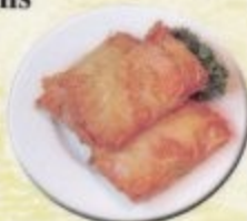
(53) 腐皮羅漢卷 Grilled Vegetarian Bean Curd Rolls