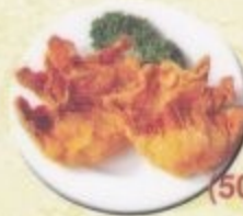
(50) 沙律明蝦角 Deep Fried Seafood Dumplings