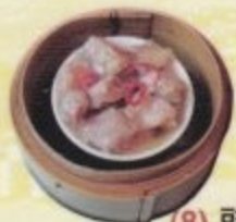
(8) 豉汁蒸排骨 Spare Ribs in Black Bean Sauce