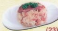
(23) 臘味糯米飯 Glutinous Rice with Dry Mixed Meat