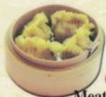
(4) 魚翅餃 Meat & Prawn Fish Fin Dumplings