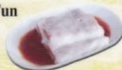
(84) 牛肉滑腸粉 Beef Cheung Fun