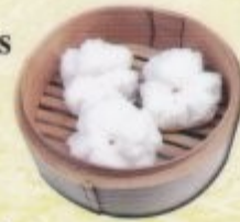
(16) 香菇雞包仔 Chicken & Mushroom Buns