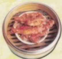
(7) 豉汁蒸鳳爪 Chicken Claws in Black Bean Sauce