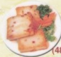
(48) 臘味蘿蔔糕 Grilled Turnip Cakes