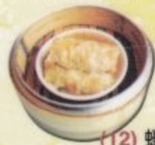
(12) 蠔皇鮮竹卷 Steamed Meat Beancurd Rolls