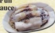
(88) 甜香麻醬淨腸粉 Plain Cheung Fun with Sesame Sauce