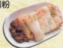
(86) XO 醬煎腸粉 Grilled Cheung Fun XO Sauce