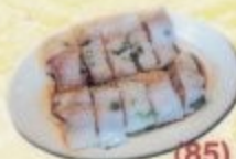
(85) 鬼馬炸兩腸粉 Deep Fried Doughnut Cheung Fun