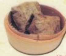
(21) 迷你糯米雞 Mini Glutinous Rice in Lotus Leaves