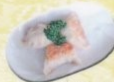
(41) 生煎鍋貼 Grilled Mini Prawn & Pork Dumplings