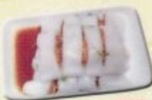
(89) 百花腐皮腸粉 Crispy Bean Curd Rolls Stuffed with Mince Prawn Cheung Fun