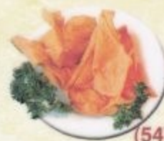
(54) 甜酸炸雲吞 Sweet & Sour Won Ton