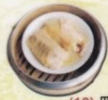
(10) 四寶滑雞扎 Steamed Beancurd Rolls with Chicken, Mushroom