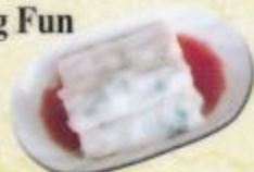
(82) 香茜帶子腸粉 Scallop Cheung Fun