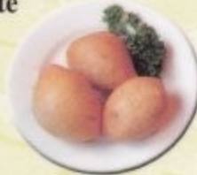
(46) 家鄉鹹水角 Crispy Pastry Savoury Meat Croquette