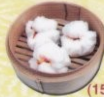
(15) 蜜汁叉燒包 'Char Sui' Barbecued Roast Pork Buns