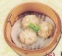
(6) 上海小籠包 Steamed Shanghai Dumplings