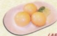
(45) 酥炸奶皇包 Deep Fried Cream Custard Buns