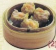
(2) 蟹皇燒賣 'Siu Mai' Pork Dumplings