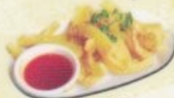
(56) 甜酸炸鮮魷 Deep Fried Sweet & Sour Squids