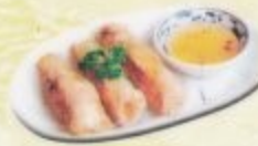
(44) 越式春卷 Vietnamese Spring Rolls