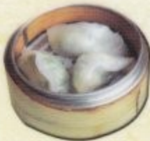
(3) 鮮韭菜蝦餃 Prawn with Chives Dumplings