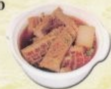
(22) 沙爹蘿蔔牛肚 Beef Honeycomb in Satay Sauce