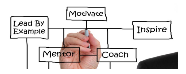
Georgia Parent/Family Information and Resource Center