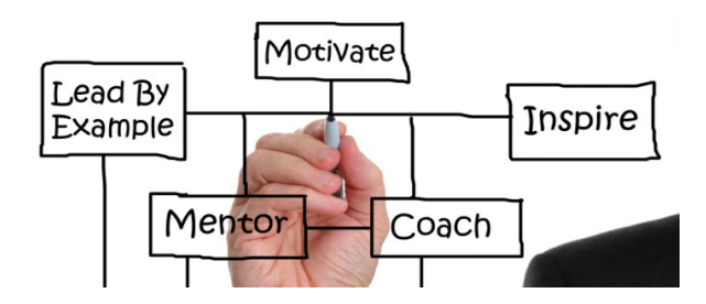
Georgia Parent/ Family Information and Resource Center www.gadoe.org

The site is maintained by the Georgia Department of Education to provide tools that may help you, as the primary educator of your child, to further his or her advancement and educational success.