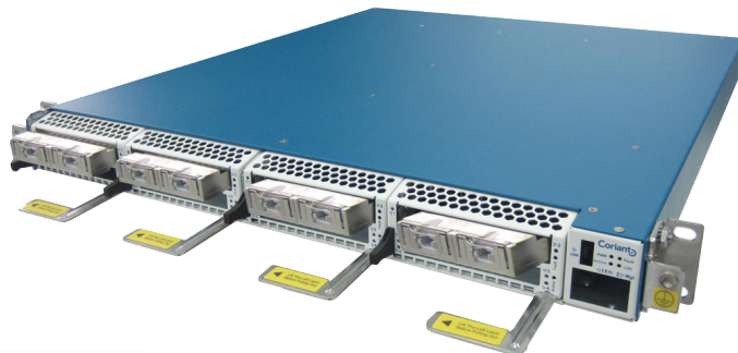
Coriant Groove™ G30 DCI Platform

The innovative three-tier modular concept of the Coriant Groove™ G30 DCI Platform provides a number of competitive advantages to DCI and telecom network planners and architects. The Coriant Groove™ G30 DCI Platform supports up to four field replaceable, individually configurable and hot-swappable 400G sleds (or field replaceable units). Each 400G sled can be equipped with up to two 200G line side interfaces (CFP2-ACO) and up to four 100G client side interfaces (QSFP28). Another 400G sled variant supporting a mix of 10G, 40G, and 100G clients is also available. The sleds and the pluggable interfaces can be purchased and deployed one at a time as required.