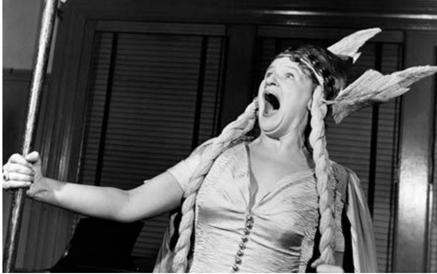
Anna Russell, ca. early 1950s.