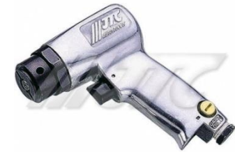
JTC-3824 AIR SANDER