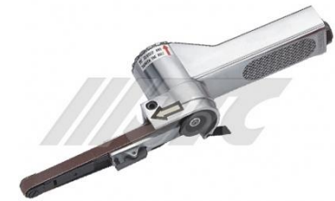
JTC-5904 10M M AIR BELT SANDER