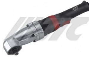
JTC-3835 1/2"DR. HI-TORQUE ANGLE HEAD AIR IMPACT WRENCH