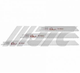
JTC-3748 WIDE TYPE SAW BLADES – 12" x 14T