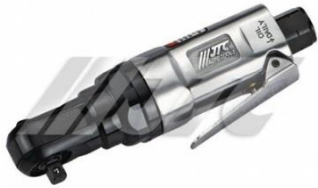
JTC-3404 1/4" 90° AIR PALM RATCHET WRENCH