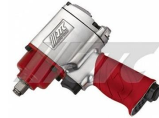
JTC-3401 1/2" HEAVY DUTY AIR MINI IMPACT WRENCH