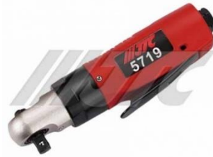
JTC-5719 3/8" HEAVY DUTY AIR RATCHET WRENCH