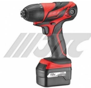
JTC-5509 18V 3-IN-1 RECHARGEABLE SCREWDRIVER