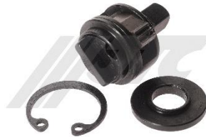
JTC-3929P REPAIR KITS FOR JTC-3929, 3404