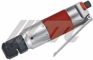
JTC-5837 AIR METAL PUNCH FOLDER