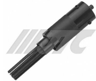
JTC-5445 AIR HAMMER DERUSTING NEEDLES