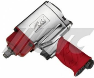
JTC-5212 1/2" AIR IMPACT WRENCH (1000LB)