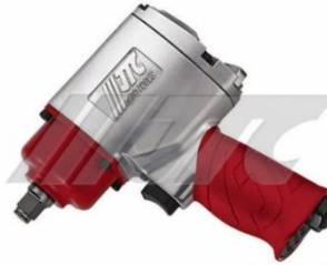
JTC-5812 1/2" HEAVY DUTY AIR IMPACT WRENCH (800LB)