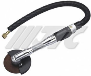
JTC-5643 AIR CORNER DIE GRINDER