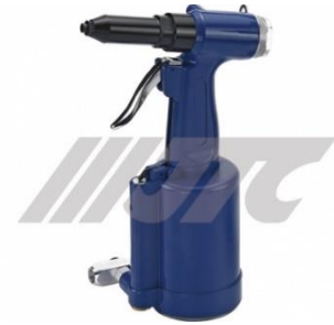
JTC-5819 1/4" AIR RIVETER