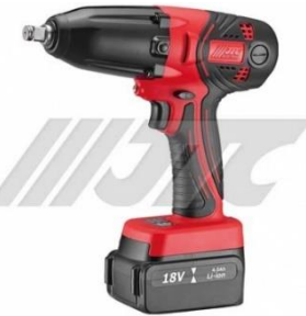
JTC-5510 18V 1/2" RECHARGEABLE IMPACT WRENCH