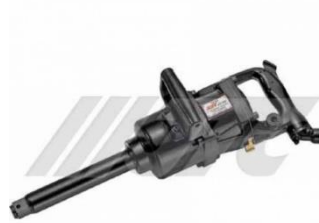
JTC-5223 1" LONG ANVIL AIR IMPACT WRENCH (LIGHT WEIGHT)