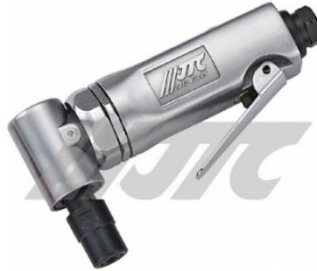
JTC-5815 ANGLE DIE GRINDER