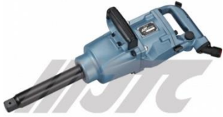
JTC-5814 1" LONG ANVIL AIR IMPACT WRENCH