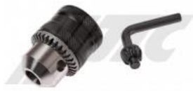
JTC-3833P REPAIR KITS FOR JTC-3833, 3320A, 3837