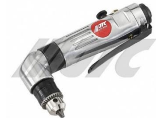
JTC-3837 TWO WAY ANGLE AIR DRILL