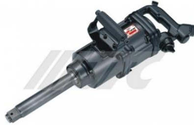
JTC-5901 1" LONG ANVIL AIR IMPACT WRENCH