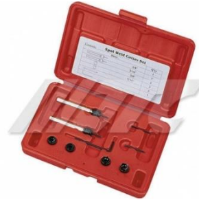
JTC-3321 SPOT WELD CUTTER KIT