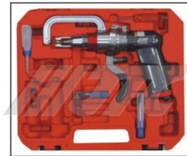
Optional kit: 3825A-K