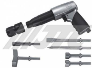
JTC-3310K 8 PCS AIR HAMMER SET