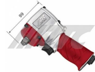
JTC-5301 1/2" MINI AIR IMPACT WRENCH