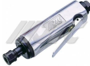
JTC-3822 AIR DIE GRINDER