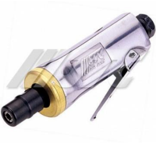
JTC-3101 MINI AIR DIE GRINDER