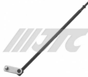
JTC-5421 1/2" IMPACT ADAPTER FOR AIR HAMMER