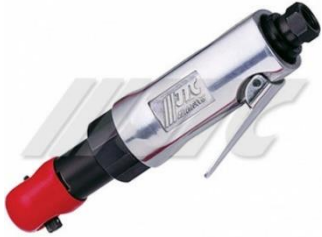
JTC-3929 1/4" STUBBY AIR RATCHET WRENCH