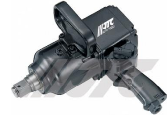
JTC-5813 1" AIR IMPACT WRENCH