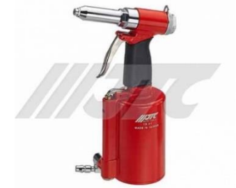
JTC-5114 1/4" HEAVY DUTY AIR RIVETER