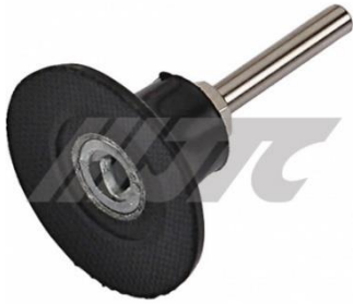
JTC-5806 2" STRIPPING DISC WITH SHAFT