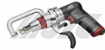
JTC-3825A LOW SPEED AIR SPOT DRILL