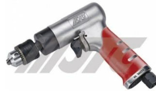
JTC-3320A AIR REVERSIBLE DRILL