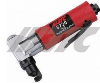
JTC-5720 AIR NIBBLER & KNIFE