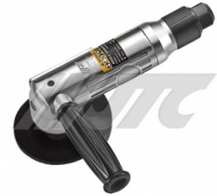
JTC-5646A 4" AIR GRINDER