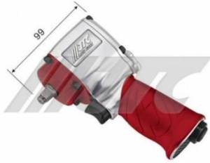
JTC-5306 3/8" MINI AIR IMPACT WRENCH