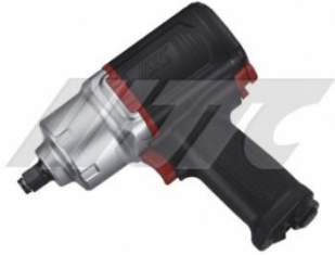
JTC-3834 1/2" ULTRA DUTY COMPOSITE AIR IMPACT WRENCH (1100LB)