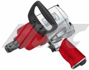
JTC-5446 1" AIR IMPACT WRENCH