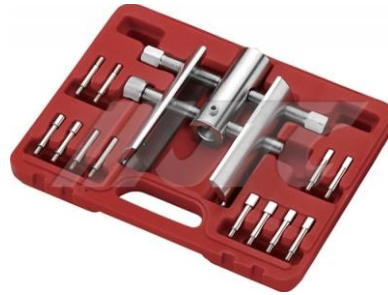
JTC-4045 UNIVERSAL ADJUSTABLE WHEEL BEARING LOCK NUT TOOL KIT