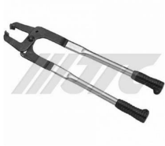
JTC-4268 HUB CAP PLIERS