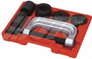
JTC-1037 BALL JOINT ANCHOR PIN PRESS SET