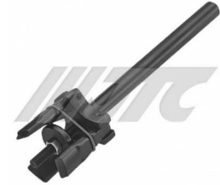
JTC-5573 TRUCK ADJUSTABLE BEARING INSTALLER