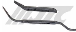
JTC-1239 BRAKE SPOON