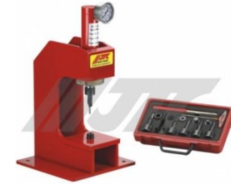
JTC-1517 HYDRAULIC BRAKE LINING RIVET MACHINE