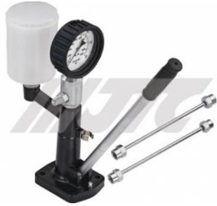
JTC-4818 DIESEL INJECTOR TEST AND CALIBRATING HAND PUMP