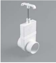
Shut-off valve in open position

Your spa is equipped with shut-off valves (see EQUIPMENT DIAGRAM) that shut off the water flow to the equipment system for dealer service. At times, a new spa or one that has recently been serviced, may have the shut-off valves partially closed which can restrict the water flow and hinder jet performance. Be sure the valves are fully open.