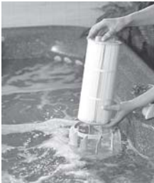
1) Center filter cartridge over canister

When a freeze condition is detected (which occurs when the temperature in the heater housing drops to 55°F, (13°C) the jet pump(s) is automatically activated. In areas with extremely cold winter conditions, your spa should be fine as long as it is left running at normal operating temperatures. For extra protection see your dealer for an optional freeze sensor. If you plan to turn the spa off, follow the instructions in this manual (see SUSPENDED USE OR WINTERIZING YOUR SPA).