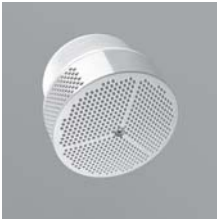
Safety guard of suction fitting must remain in place.

The suction guard(s) in the footwell of your spa is an opening through which the jet pump(s) draws water. Suction fittings are equipped with a safety guard. Suction through the fittings can be strong. The safety guard(s) must remain in place and undamaged. A fitting with a damaged guard(s) can be dangerous, especially to small children or people with long hair. Should any part of the body become drawn to a fitting, turn the jet pump(s) off immediately. Long hair should be restrained in a bathing cap, never allow it to float freely in the spa. Replace any missing or damaged suction guard(s).