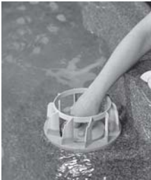
2) Screw filter cartridge in place