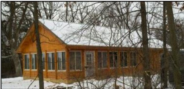
An incredible log cabin look outside