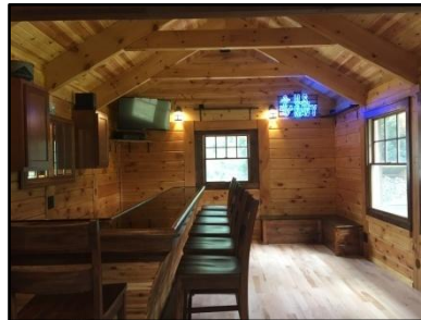
Cozy knotty pine look inside

By mixing and matching full log wall panels, window wall panels and door wall panels you can achieve any cabin configuration imaginable. Locate interior rooms as desired from a wide open cabin, multi- bedroom cabin or anything in between.