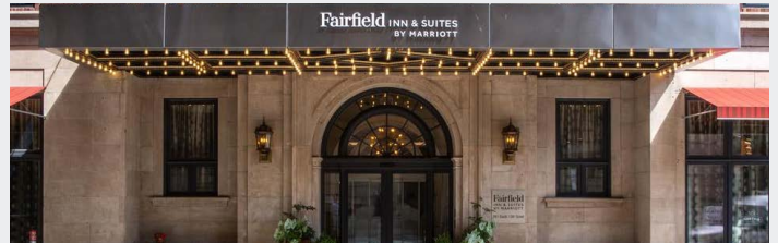
Fairfield Inn & Suites by Marriott Downtown

★★★★★ 220 South 17th Street, Philadelphia