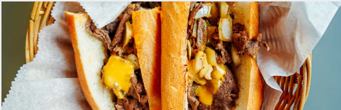
Philadelphia's Beyond the Cheesesteak Walking Tour Including Penn and Drexel