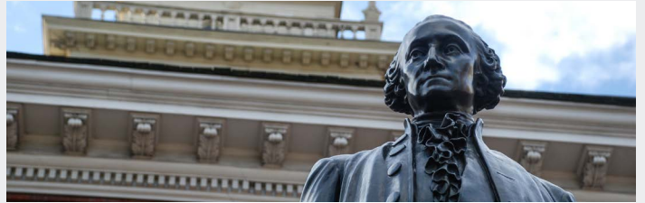
A Local History Of Philadelphia