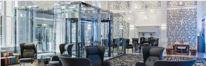
The Warwick Hotel Rittenhouse Square

★★★★★ 220 South 17th Street, Philadelphia