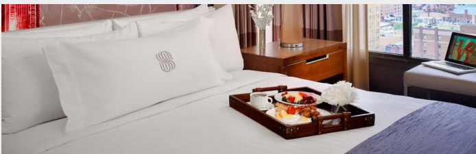
Sonesta Hotel Philadelphia