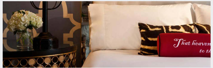
Kimpton Hotel Monaco Philadelphia