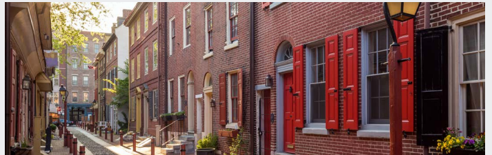
Old City and Tavern Tour of Philadelphia