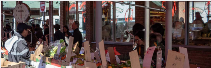
Markets, Mosaics, & Magic by Urban Adventures