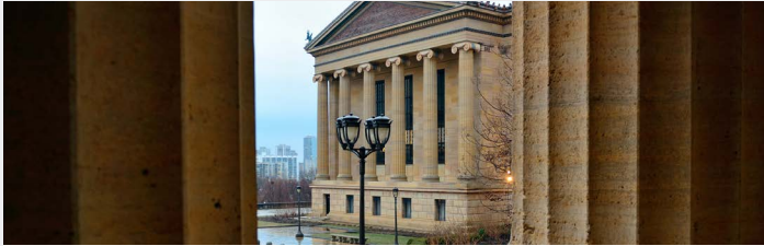
The Philadelphia Explorer Pass