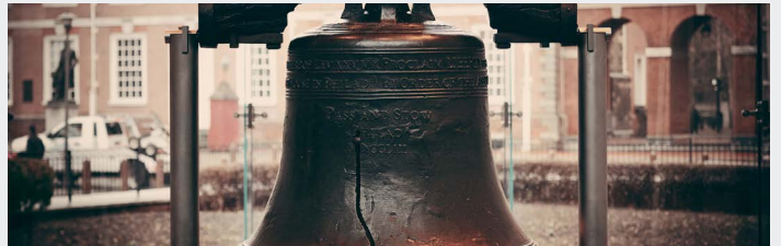
History in HD by Urban Adventures