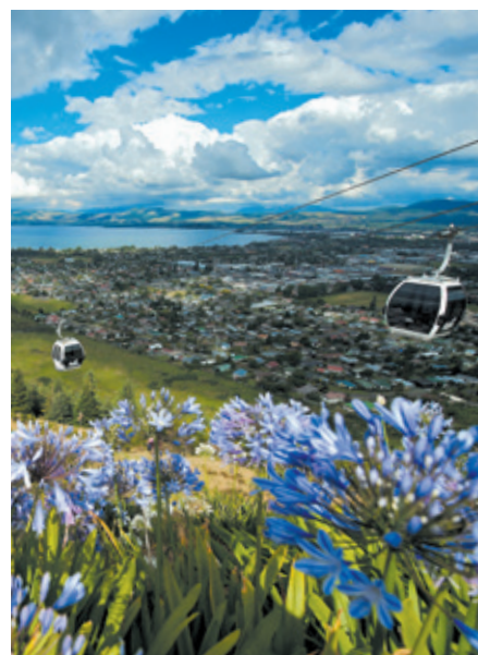
TOP TO BOTTOM: Cruise Milford Sound where you will see the spectacular Bowen Falls and towering Mitre Peak; a guided tour of Larnach Castle will reveal an interesting history; a delicious cooked breakfast and spectacular views are on offer at Skyline Rotorua.