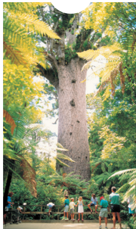
TOP: Visit the Zealoug Tea Estate for a tour and tasting. ABOVE: Tane Mahuta, the Lord of the Forest, standing an impressive 51 metres.