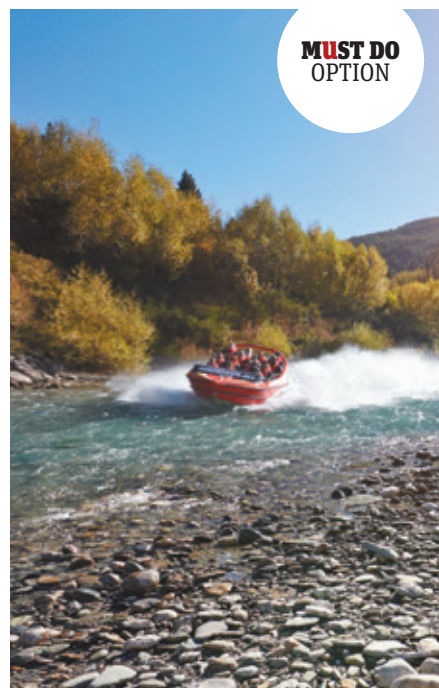
TOP TO BOTTOM: The Sky Tower offers breathtaking views over Auckland; Discover the traditions of Maori Culture; during your free time in Queenstown why not experience the thrill of an optional jet boat ride on the iconic Shotover River.