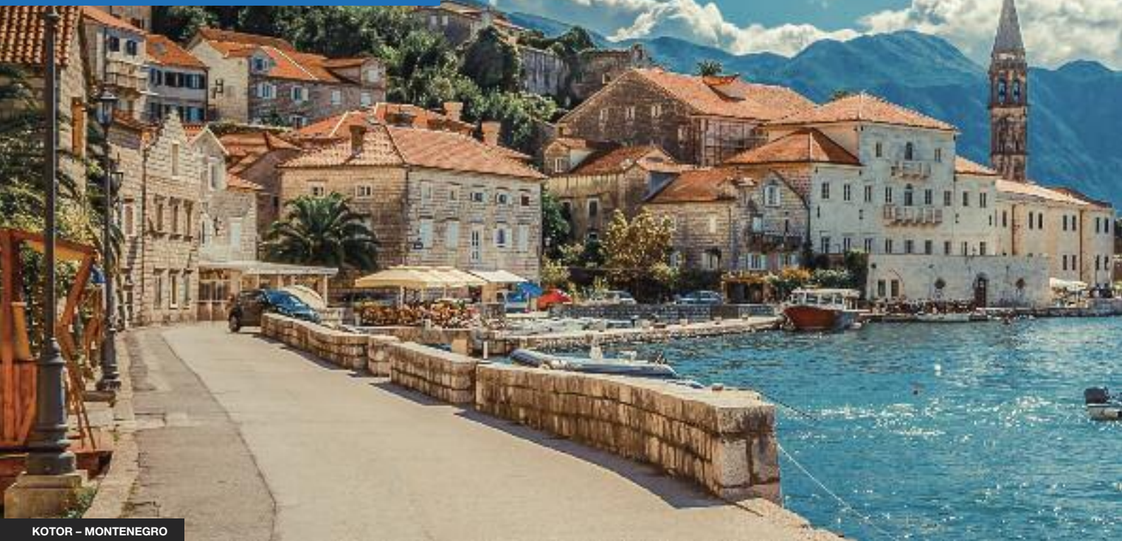
KOTOR – MONTENEGRO