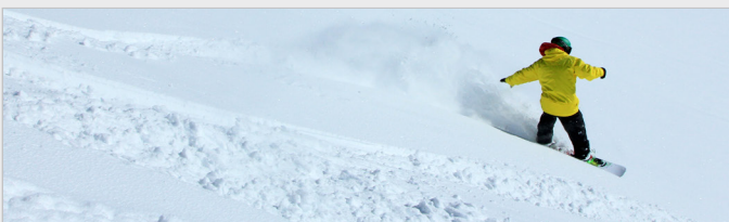
Adult Snowboard Rental Package for Salt Lake City - Cottonwood ✉