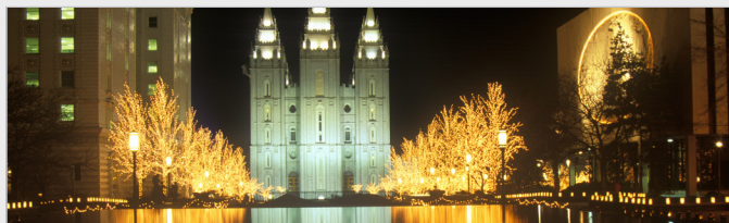
Salt Lake City Tour and the Tabernacle Choir at Temple Square Performance ✉