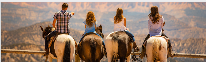
Ruby's Horseback Adventures ✉