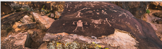
Santa Clara petroglyphs Tour from St George ✉