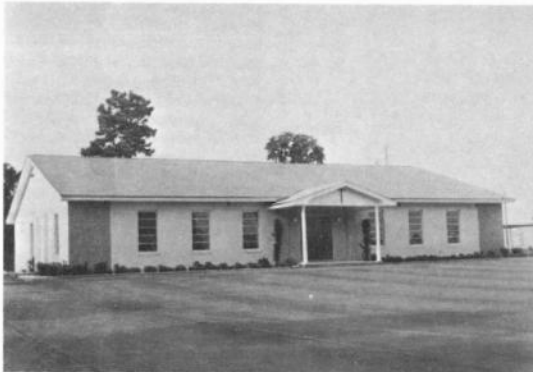
PROVISIONAL CHURCH IN CASSELBURY