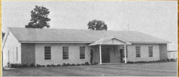
1971: Ground was broken for a multipurpose provisional church hall to accommodate the growing parish community. First Mass was celebrated in the parish hall.