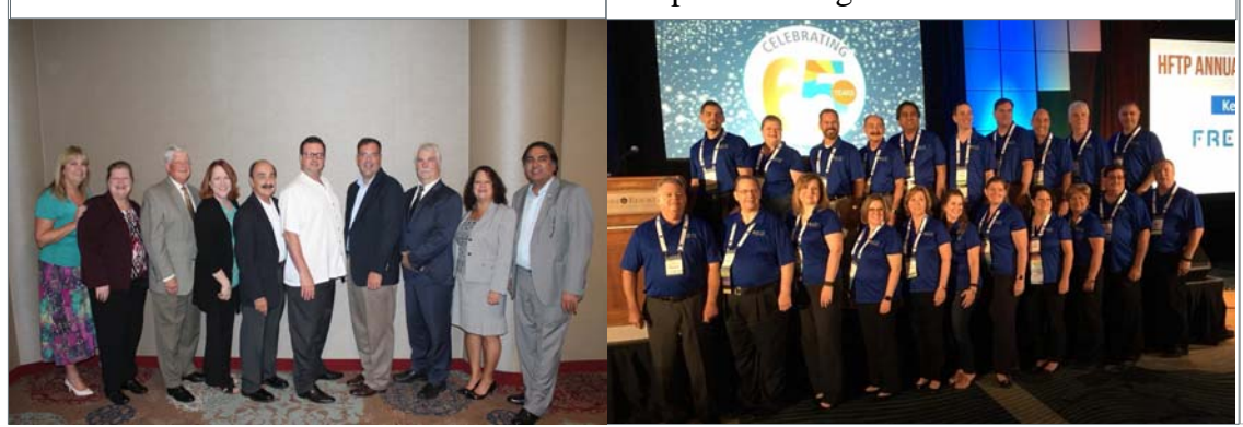
Chapter showing at the 2017 HFTP Annual

Committee Assignments 2017-2018 We need you !!! If you are interested in contributing to any of the committees, please contact any Board Member.