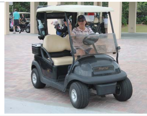
We held a coronation, welcoming new HFTP Mid-Florida Chapter Leaders.