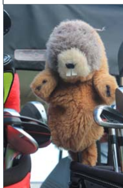
Knock my socks off!