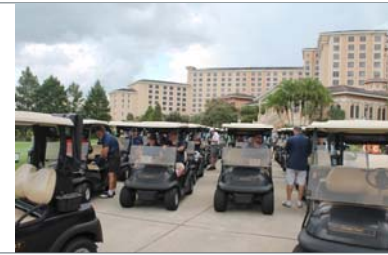
And off they go !!