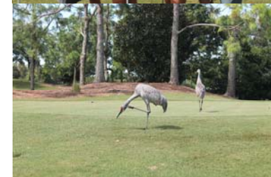
The Cranes made it.