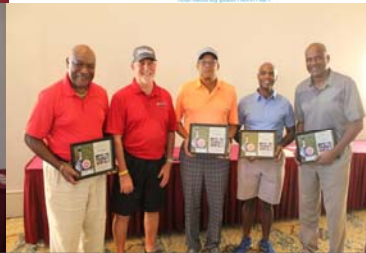
Event Winners 1st, 2nd and 3rd

We had winners and losers but we all had fun and the real winners were the KIDS!