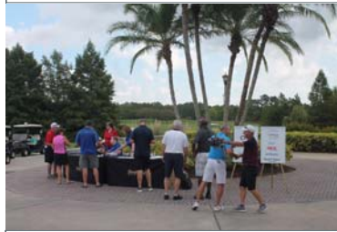
The sign up crew does their magic