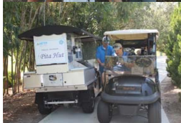
Looking for directions to the Bervcart