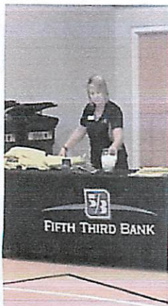
Special thanks to Fifth-Third Bank for helping sponsor the 2016 Bookbag

Each year we are honored to be able to serve our community's young people as they prepare to return back to school by giving away free bookbags packed full of the supplies such as notebooks, pens, pencils, glue, rulers and other necessities. We firmly believe that by helping these children with getting back to school and giving them a great start each year, they are less likely to use drugs or alcohol in the future. Our children are the future! And we want their futures to be the best that they can possibly be!