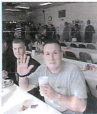
A resident waves HELLO while "gobbling" down his Thanksgiving turkey dinner!