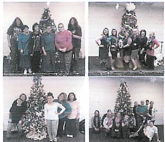
Thanks to the following ladies ministries from The Quiet Heart, New Buffalo, Faith, Old Rugged, and Gospel Way Baptist Churches for their help decorating the trees!

(Not Pictured) We also would like to thank the congregations of Mount Sinai Baptist Church and Christopher Road Baptist Church for providing Christmas meals for the men and the gifts they provided, as well as everyone who contributed to any of our community outreach programs throughout the year. We simply could not provide these outreaches to our men, ladies, and our communities without your generous support throughout the year.