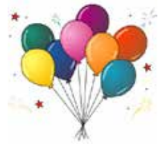
(Puzzle on page 9)