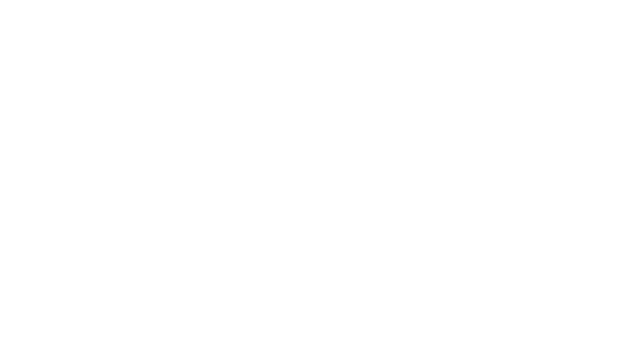
Play Better Bridge®