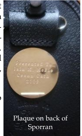
Plaque on back of Sporran