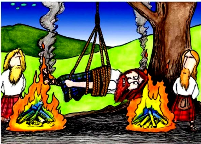
Early Scottish torture techniques, No.17: "Burning the Campbell at Both Ends."