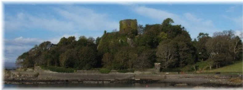
Dun Ollaigh/Cenel Loarn Mor

Summary Within the ten clans above, are five out of the seven clans which later became associated with Siol Alpin. The Clans Grant and MacAuley are missing, (some sources have these two clans as a branch of Clan Gregor). According to the Senchus Fer nAlban, these five clans are not of Siol Alpin, or descended from Fergus Mor, but rather they descended from his brother Loarn Mor and therefore, these five clans are among the Cenel Loarn Mor (descendants of Loarn Mor). Why was there a connection made to the seven clans with Siol Alpin and Fergus' branch rather than Loarn's? Possibly the genealogies were not well understood and/or the temptation to relate to the more famous King Kenneth mac Alpin (Siol Alpin) made it easier to jump from one branch of the family tree to the other. No family or clan alive today is older than any other. Some may have more written about them, but we all have ancestors stretching back thru prehistoric times. Having walked the hills up to Dun Add and Dunollie and walked among the 5,000 year old prehistoric standing stones and stone circles in Dun Add Dun Add Kilmartin Valley, I felt some sense of connection with peop Dunaverty/Abertaigh from so long ago.