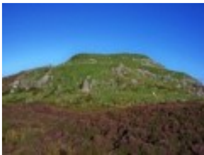
Dun Eibhinn on Colonsay