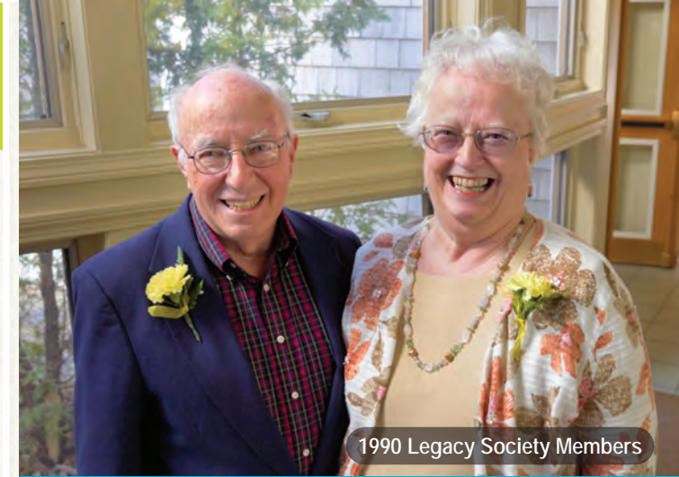
1990 Legacy Society Members