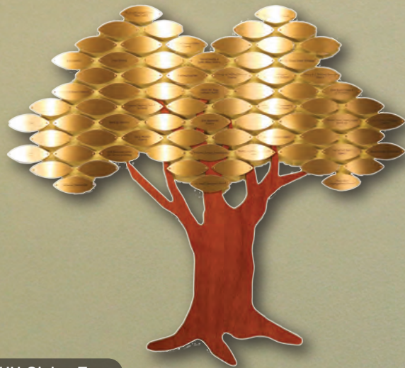
SCHH Giving Tree

You may find that a gift from these assets has tax advantages that enable you to make a much larger gift to SCHH than you could make out of your current income. Your gifts allow you to transform the lives of families in need of a hand up, providing a world where everyone has a decent place to live.