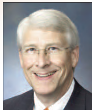
ROGER WICKER United States Senator