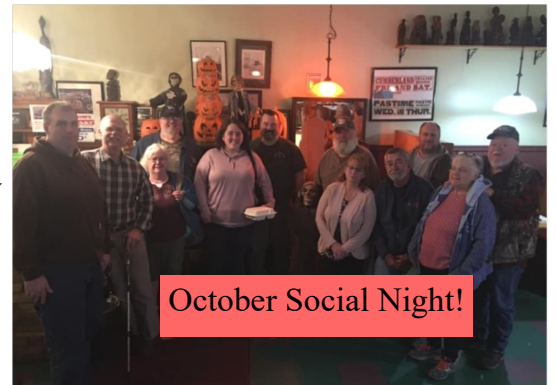
October Social Night!

Our Social Night is held on the second Wednesday of each month at 6:00pm. This Month (Nov) 13th will be held at the Pancho Villa Mexican Restaurant - Authentic Mexican Cuisine. Located at 164 Pleasant St., Brunswick. Come and enjoy a night on the town with family and friends!