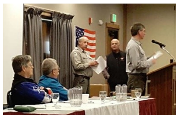
ATV MAINE BANQUET