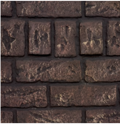
CERAMIC BRICK LINER

Available for the Q1, E20, E30, E33, and the E44