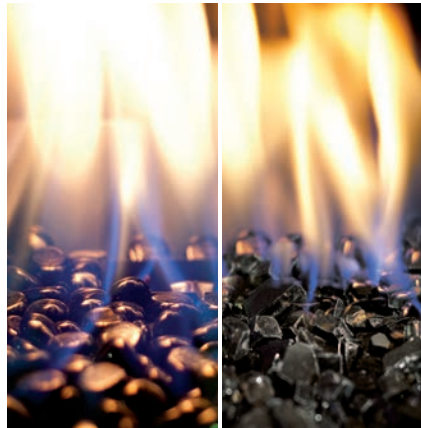
TRAY BURNER WITH GLASS

Beads for the E20, E30 and E33 / Crushed for Q1