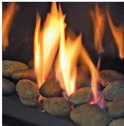
HIGH DEFINITION ROCK SET