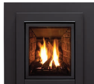
CONTEMPORARY W/TRIMMABLE PANEL