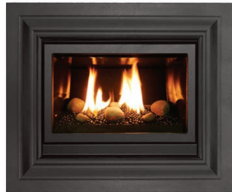
4 - SIDED EXTRUDED