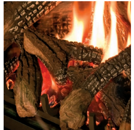
HIGH DEFINITION LOG SET

Beads for the E20, E30 and E33 / Crushed for Q1