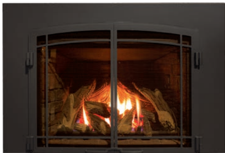
CAPE COD DOORS