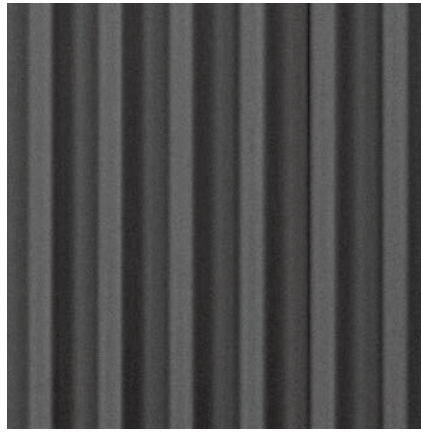
CERAMIC FLUTED LINER

Available for the Q1, E20, E30, E33, and the E44