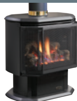
Safety Screen Barrier