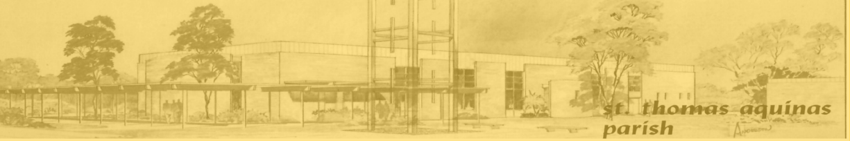
st. thomas aquinas parish