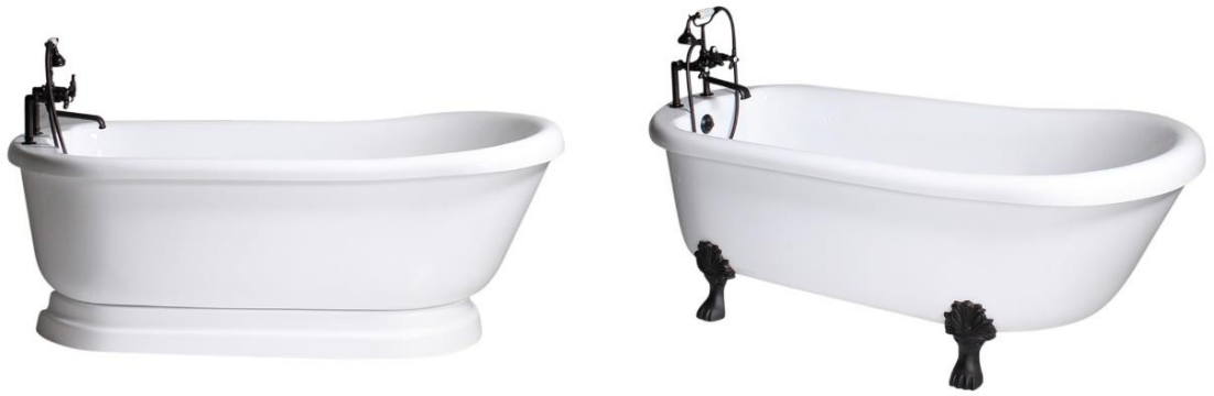
73" Single Slipper Air Jetted Tub