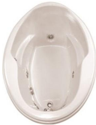
60"x41.5"x21" Shipping weight - 140lbs

Upper body jets can be shut down for operation at lower level